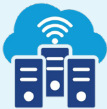
UK Data Centres