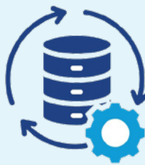
Ultra Fast Storage